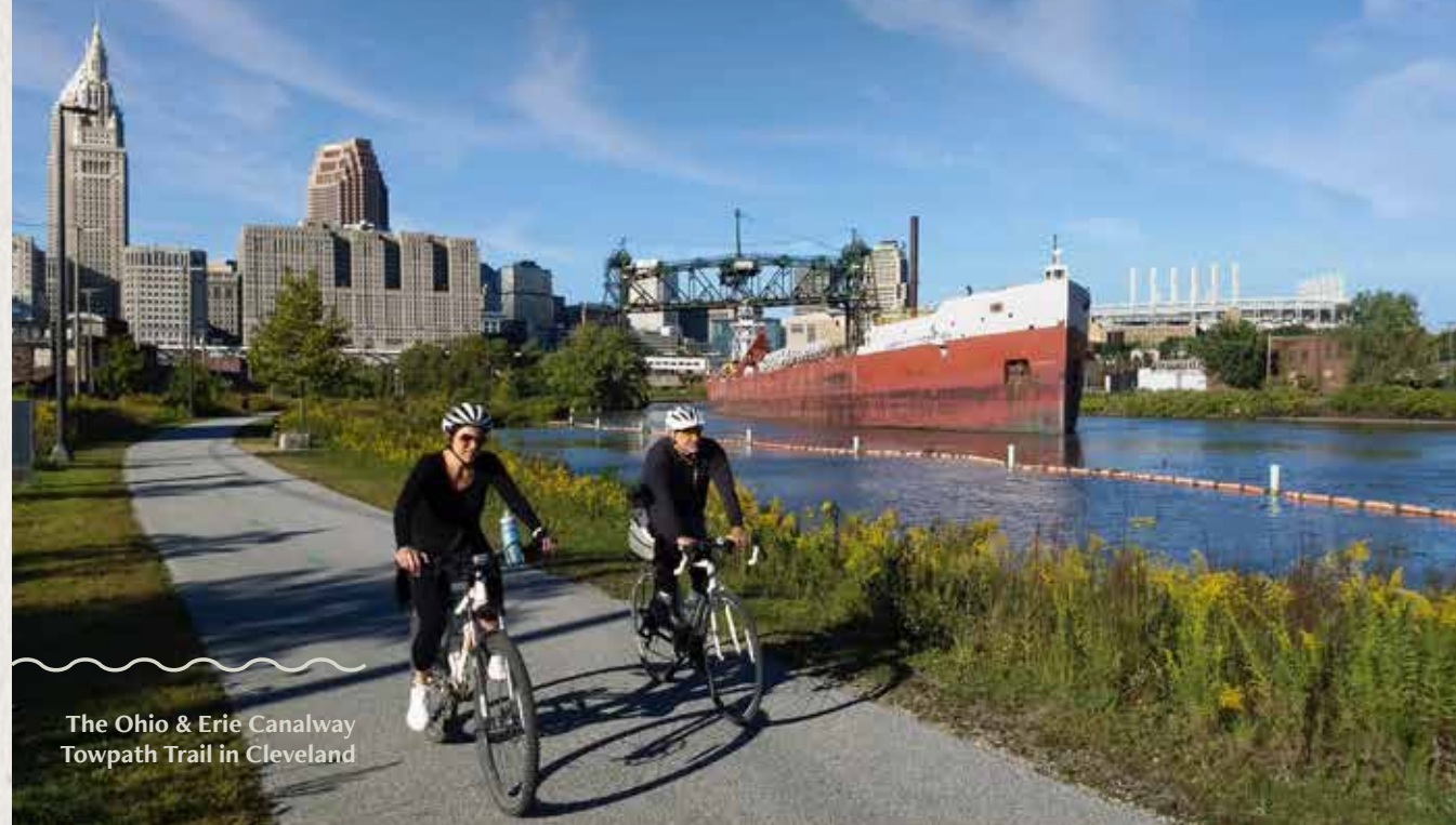
The Ohio & Erie Canalway Towpath Trail in Cleveland

■ OHIO & ERIE CANALWAY NATIONAL HERITAGE AREA | OHIO OHIOANDERIECANALWAY.COM